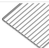
Stainless wire shelving