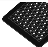
Vision Express Grill