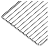
Stainless wire shelving