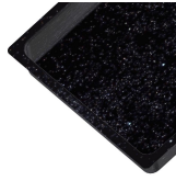
Enameled GN container