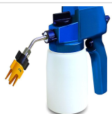
Vision Oil Spray Gun